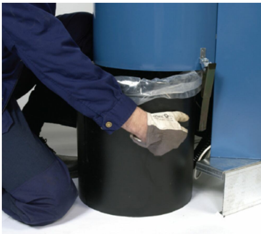
Worek z tworzywa sztucznego jest łatwy do wymiany